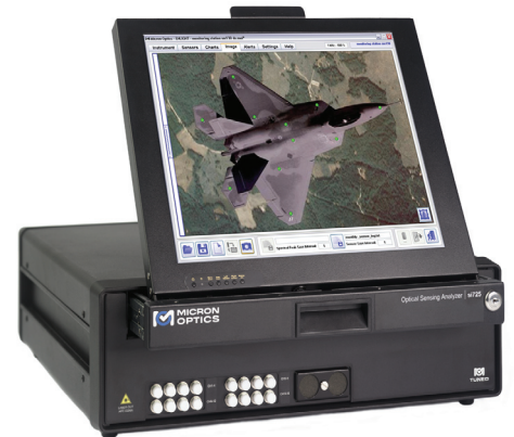
si725 Laboratory Instrument

The Micron Optics "si - Sensing Instrument" platform features an optimized Integrated EN-LIGHT environment built on Windows XP Embedded technology. In contrast with the "sm – Sensing Module" platform, Sensing Instruments support on-board management of all optical interrogator core configuration, data acquisition, sensor calibration, data visualization, and data storage tasks. Users of Integrated ENLIGHT interface to the Sensing Instruments through a touch screen LCD, external keyboard/mouse/monitor, or Windows Remote Desktop connections.